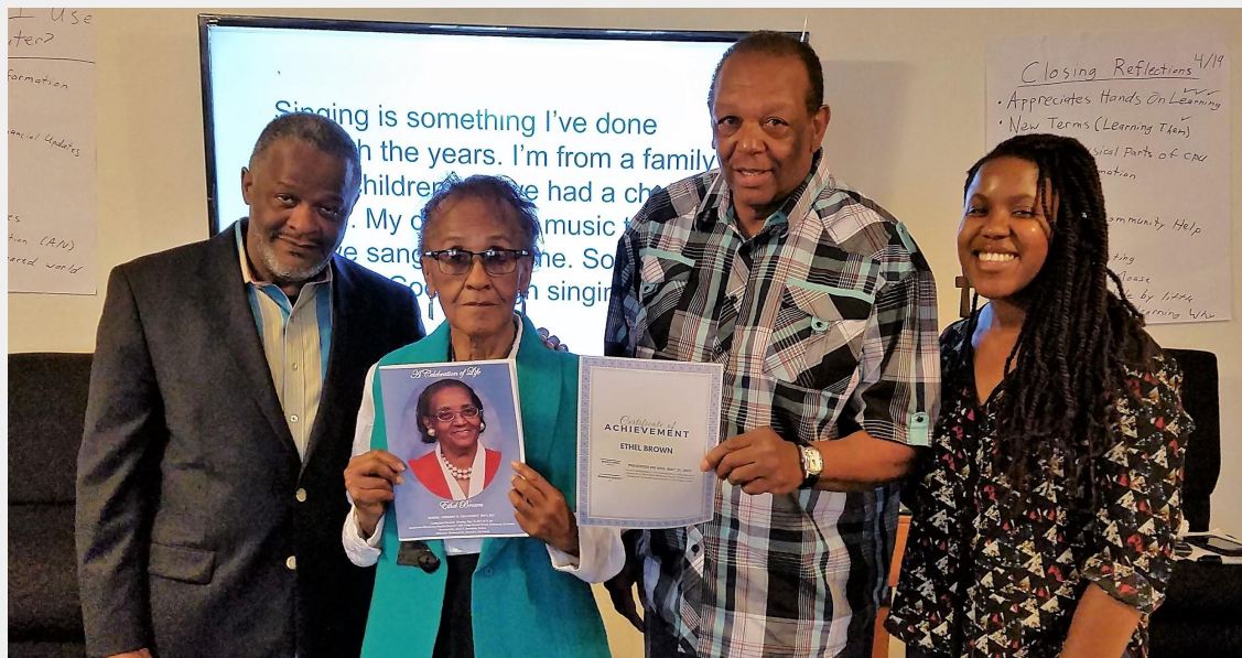
Graduation ceremony for digital literacy training participants at Bethlehem Missionary Baptist Church

Partner Churches: Bethlehem Missionary Baptist Church, Genesis Worship Center, Glad Tidings Church of God in Christ